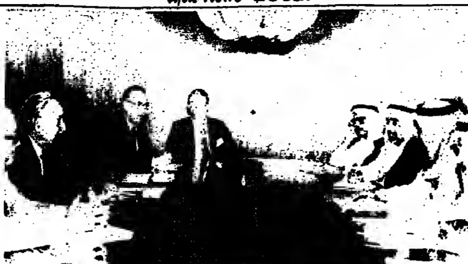
TALKS: U.S. Secretary of Treasury Donald Regan meets with Saudi Arabian members of the Saudi Arabian-U.S. joint commission.

The Saudi-American businessmen's dialogue which began last year has contributed to further expand fields of cooperation between the two countries.